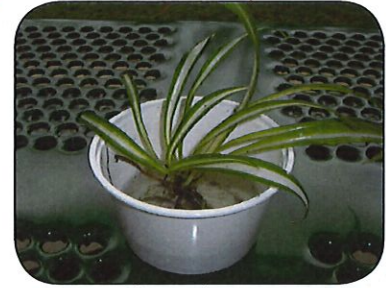
Put plants in soil, not in water.