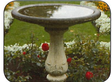
Weekly, empty standing water from fountains and bird baths.