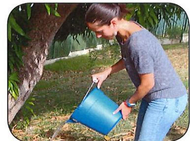
Drain & dump any standing water.