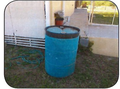
Keep rain barrels covered tightly.