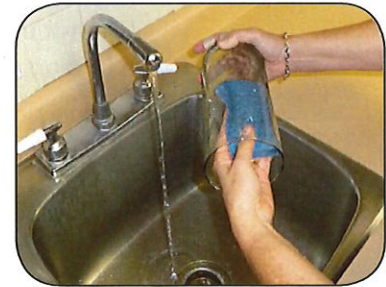
Weekly, scrub vases & containers to remove mosquito eggs.