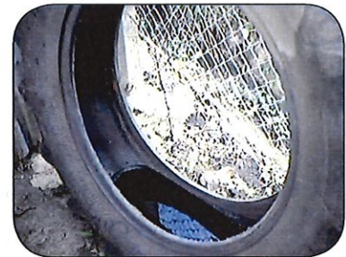
Recycle used tires or keep them protected from rain.