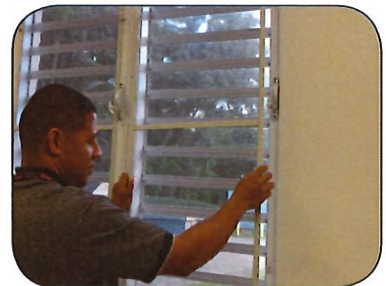
Install or repair window & door screens.

For more information, visit: www.cdc.gov/dengue , www.cdc.gov/chikungunya , www.cdc.gov/zika