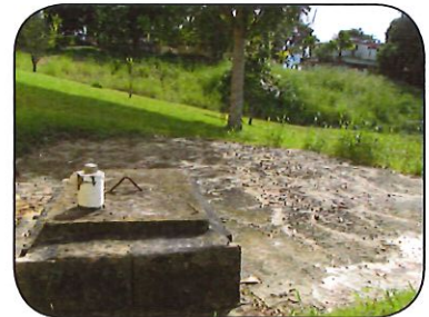
Keep septic tanks sealed.