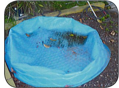
Drain water from pools when not in use.