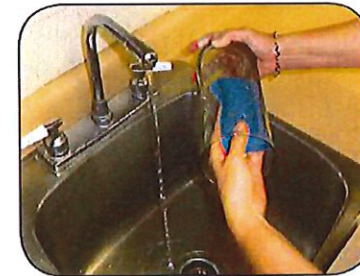
Weekly, scrub vases & containers to remove mosquito eggs.

National Center for Emerging and Zoonotic Infectious Diseases Division of Vector-Borne Diseases