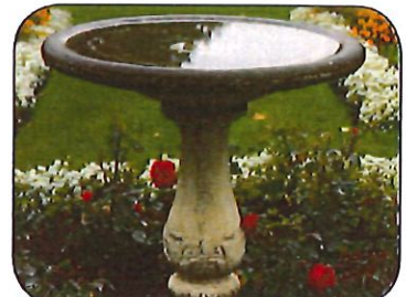
Weekly, empty standing water from fountains and bird baths.