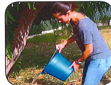
Drain & dump any standing water.