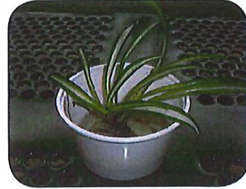
Put plants in soil, not in water.