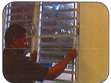
Install or repair window & door screens.

For more information, visit: www.cdc.gov/dengue , www.cdc.gov/chikungunya , www.cdc.gov/zika