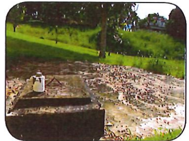
Keep septic tanks sealed.