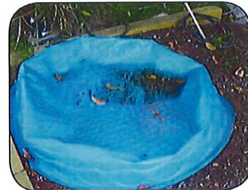
Drain water from pools when not in use.