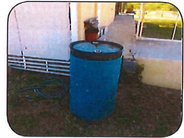
Keep rain barrels covered tightly.

* The EPA's search tool is available at: www.epa.gov/insect-repellents/find-insect-repellent-right-you